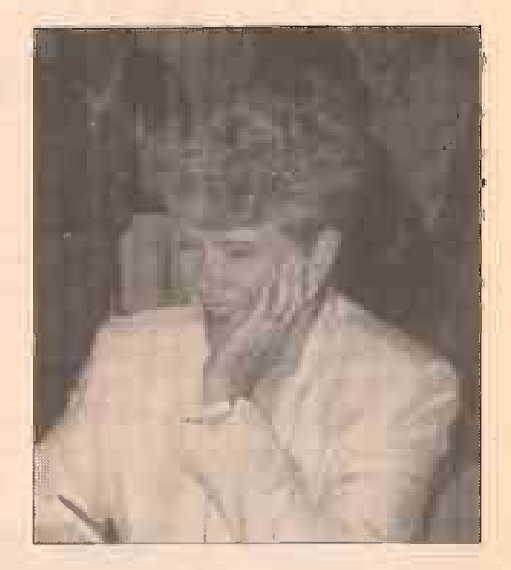
Boston, Massachusetts. Boston's Local 6, 453 and 600 hosted the group to an evening dinner cruise of the Boston Harbor and conducted a VOTE raffle raising hundreds of dollars for the union's political action fund — Voice of the Electorate. Local