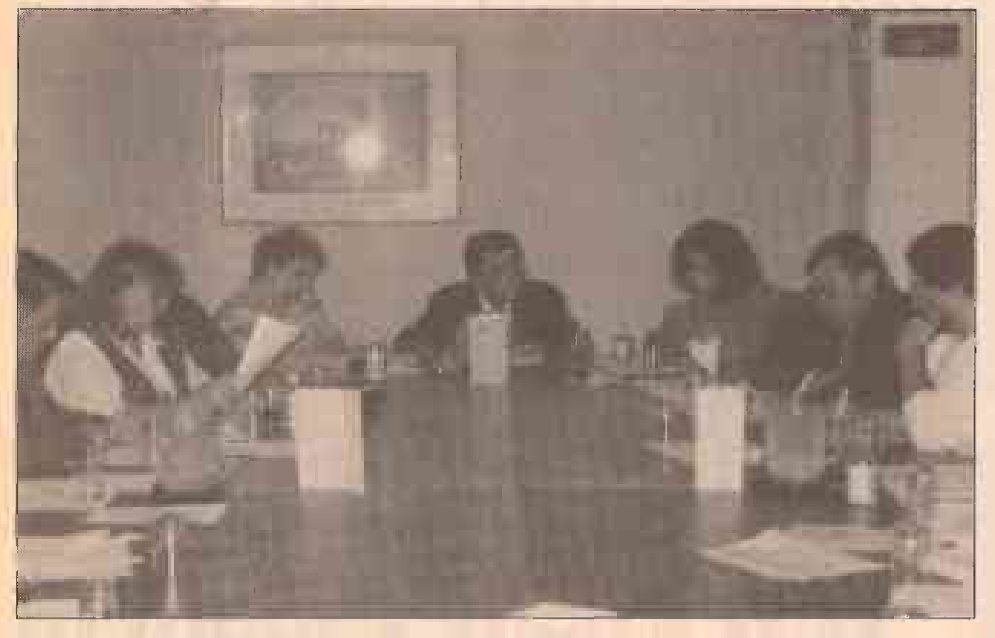
Delegates work in groups on labor-management participation problems.