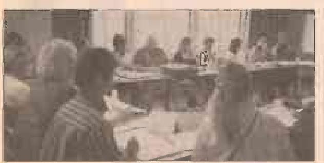
Local Union Secretary-treasurers and trustees attend financial reporting workshop.